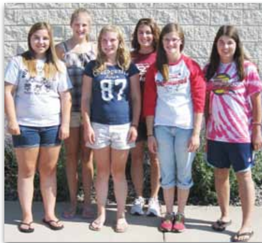
These students represented Clark Electric Cooperative at the 2012 Youth Leadership Congress.

"I especially liked learning about effective communications and the different careers in cooperatives. The speakers used audience participation and were interactive with the whole group."